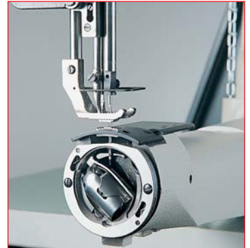
WF 905 - Large barrel shuttle hook

These WF 904 / 905 series are extra heavy duty walking foot machines, especially designed for sewing tents, bags and horse saddles. The large barrel shuttle hook offers high efficiency in heavy duty production.