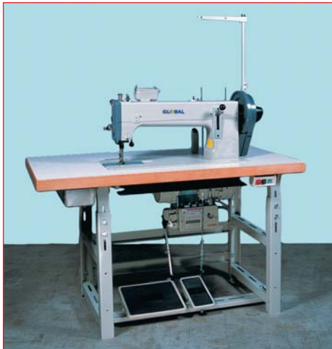
WF 904 - Complete head and stand