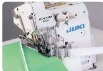
● Rolling in tape MO-6745D-FF4-360/N077 (N077: Clean finish top and bottom)