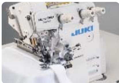
● Blind hemming MO-6705D-0D4-210/L121 (L121: Blind stitch hemming attachment)