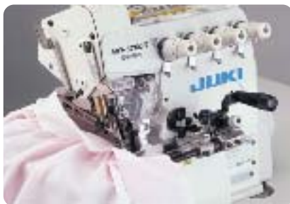
● Gathering MO-6714D-BE6-327/S162 (S162: Swing-type gathering device, manual-lever operated)