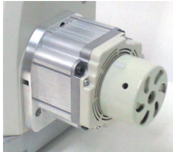
DM(Direct drive motor)