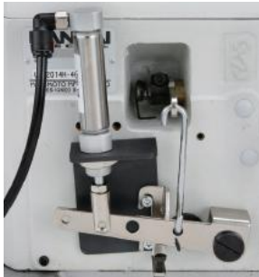
PL(Presser foot lifter)

Servo motor makes lower noise and lower vibration than clutch motor.